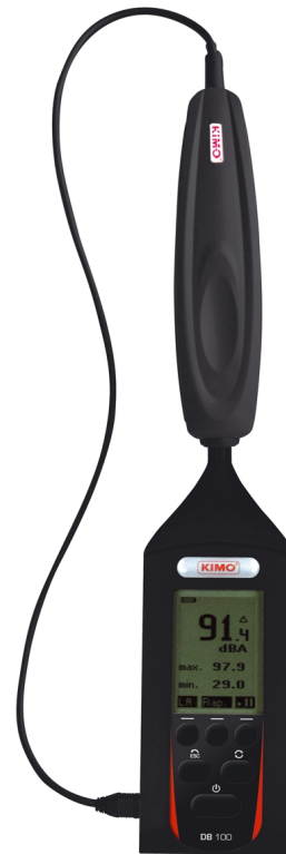
*Sound level meter supplied separately

To be carried out AFTER : - an impact applied on the instrument, - storage in extreme environment (high temperature, wet environment etc...) - a long period of storage